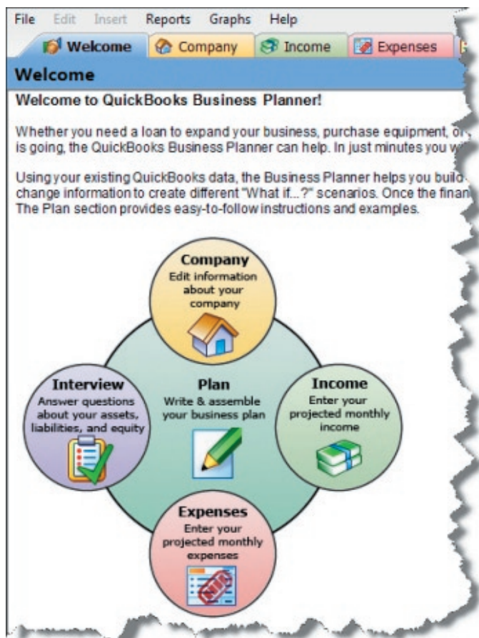
Figure 1: QuickBooks walks you through the process of creating a business plan with an easy-to-use interface.

Your income is up next, and this will take some figure-pulling (and maybe some hair-pulling). You can either fill in a spreadsheet manually, adding up to 20 categories, or